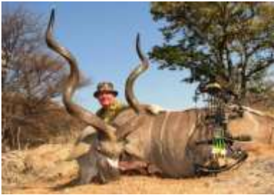
KUDU BULL – U$ 1650