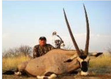
GEMSBOK / ORYX – U$ 780