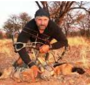
JACKAL – U$ 80 (skin fee)