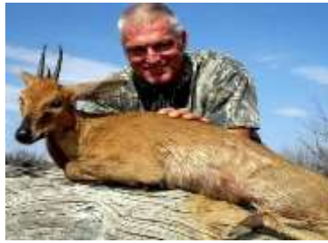
DUIKER – U$ 585