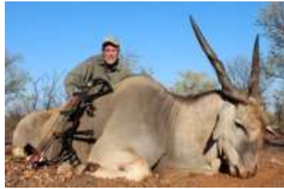
CAPE ELAND – U$ 1800