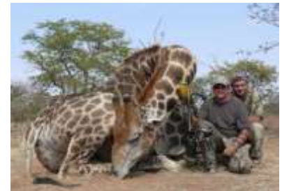
GIRAFFE – U$ 1600