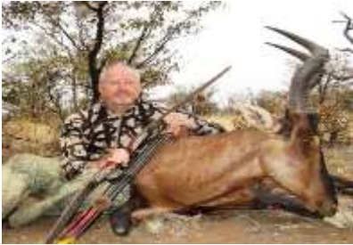
RED HARTEBEEST – U$ 850