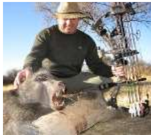
BABOON – U$ 80 (skin fee)