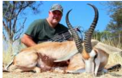
SPRINGBOK – U$ 680