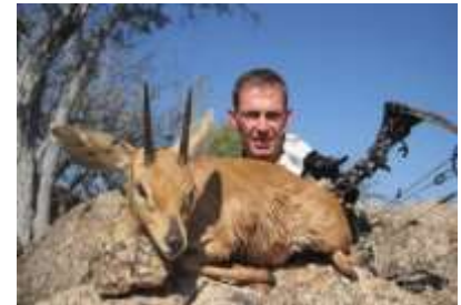
STEENBOK – U$ 585