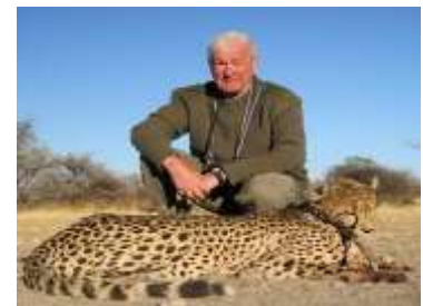
CHEETAH – U$ 4500