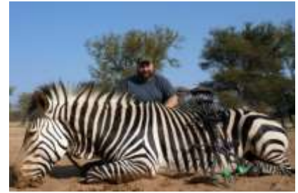
MOUNTAIN ZEBRA – U$ 1000