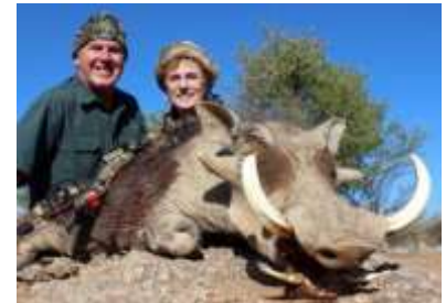
WARTHOG – U$ 575