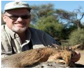
DAMARA DIK-DIK – U$ 2000