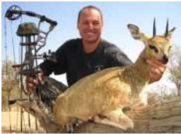
KLIPSPRINGER – U$ 1400